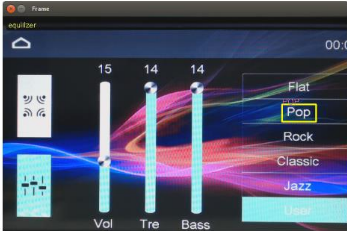
Fig: Screen detection(equalizer screen) and text searching (search for "pop") from demo application