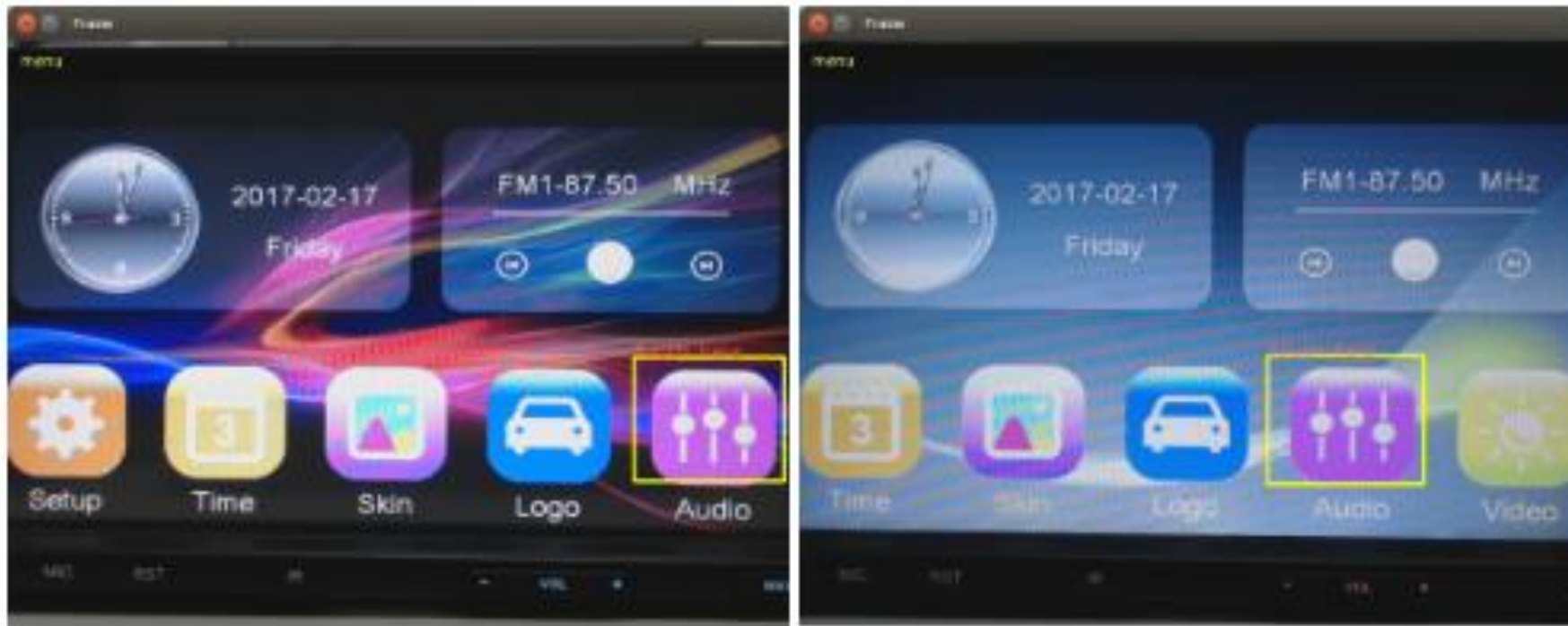
Fig: Successfully search and found audio icon with different backgrounds